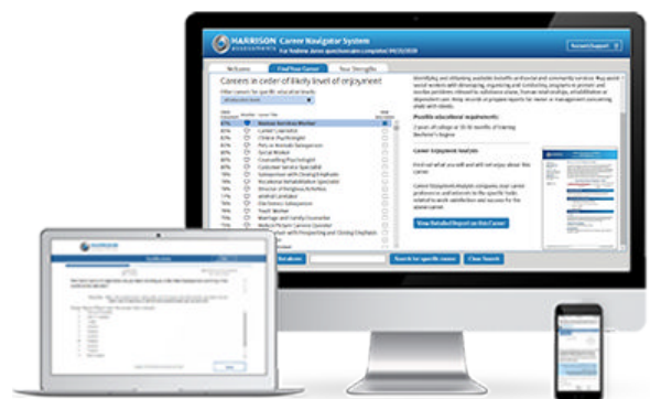
Online Interactive Career Portal